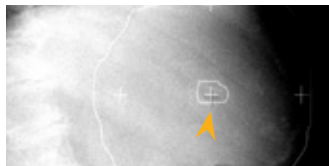
Liver: 1 VISICOIL 0.35mm x 1cm